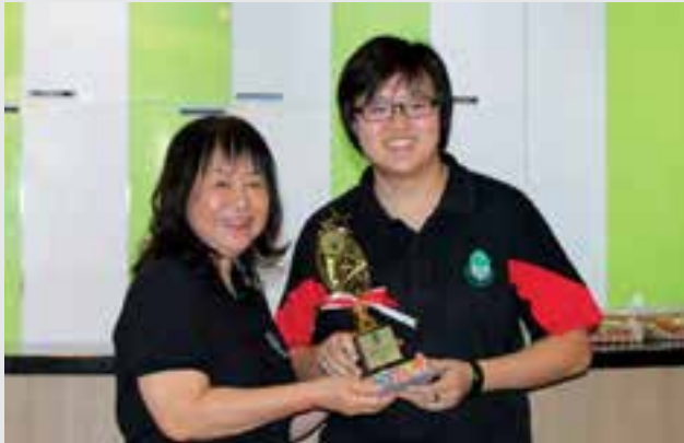
Cat A Champion