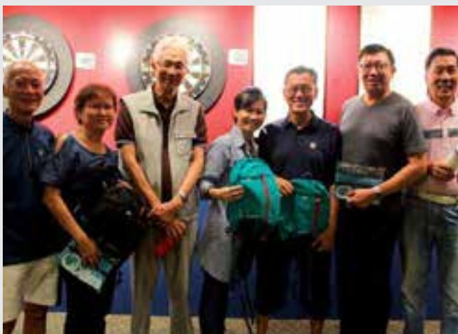
Group photo of Checkout Award Winners