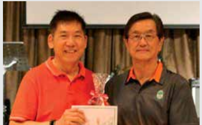
Men Master Champion