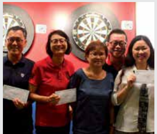
Group photo of Bowl Event