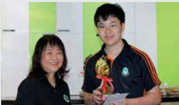
Cat B Participant Winner