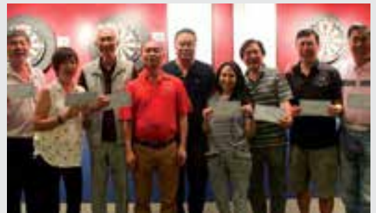
Group photo of Plate Event