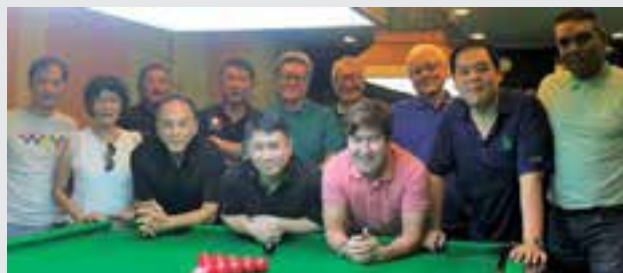
Billiard Group Photo with President