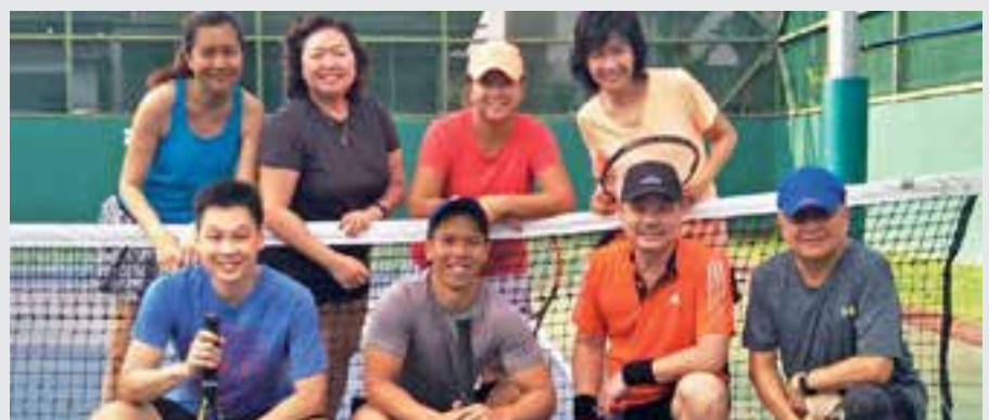
Mixed Doubles Group Photo (11 August)