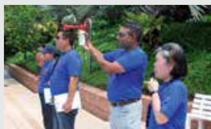
President flag off the first event of the meet