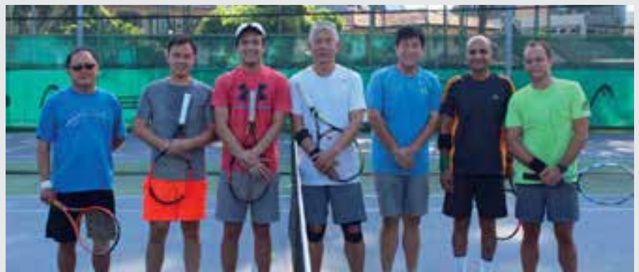
Men Doubles Group Photo (25 August 2018)

A total of 17 tennis players participated in the One Day Tennis Blind Doubles held on the 11 and 25 August 2018. The weather was great on both days, allowing all the scheduled matches to carry on as planned. All the players enjoyed themselves thoroughly.