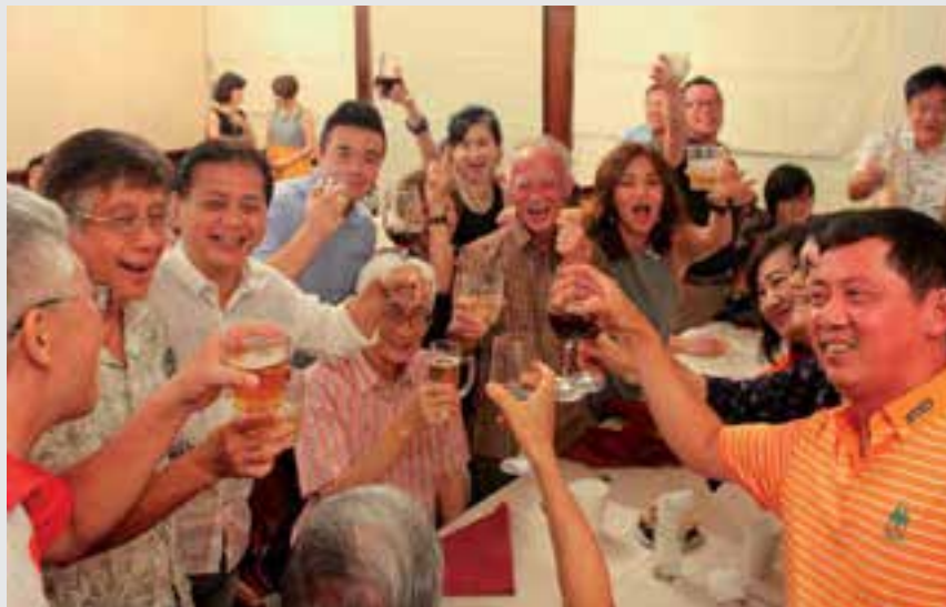
A big toast to all darters!