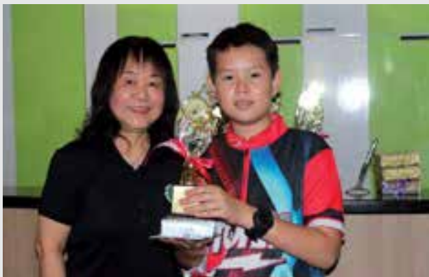
Cat B Champion