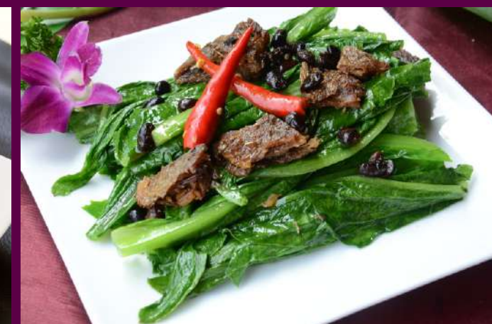
13003 油麦菜 M-$18.80 L-$28.80 Lettuce