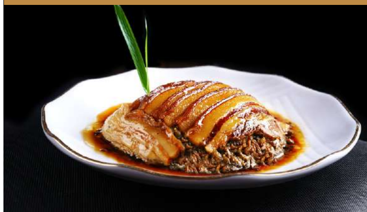
90013 金牌梅菜扣肉 $23.80 Signature Braised Pork With Preserved Vegetables