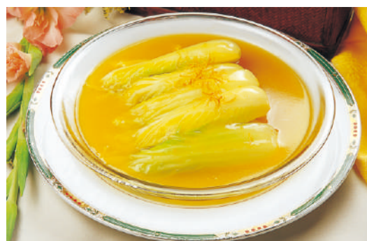
12008 浓汤浸娃娃菜 Braised Baby Cabbage in Thick Soup S-$18.80 M-$26.80 L-$32.80