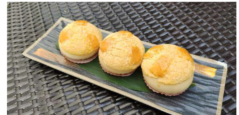
14027 奶黄菠萝包 $6.80/3 Hong Kong Style Custard Bun