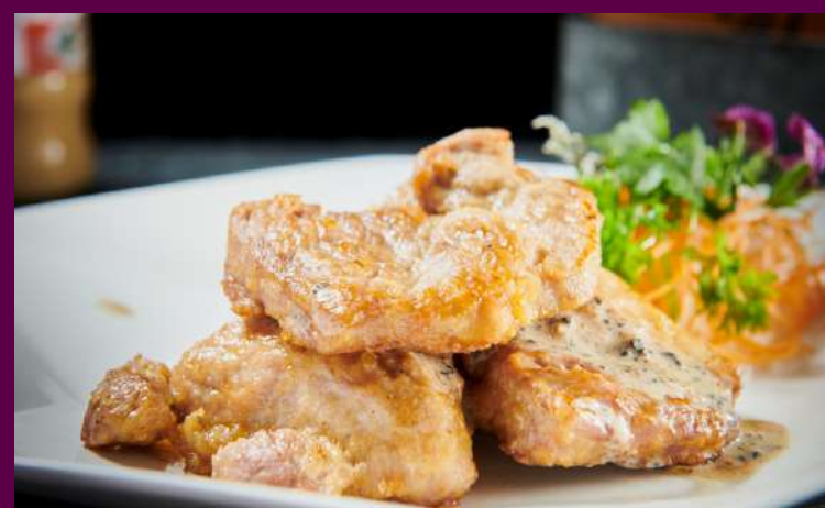
90018 香煎手工鲮鱼饼 S-$18.80 M-$26.80 L-$34.80 Pan Fried Handmade Dace Fishcake