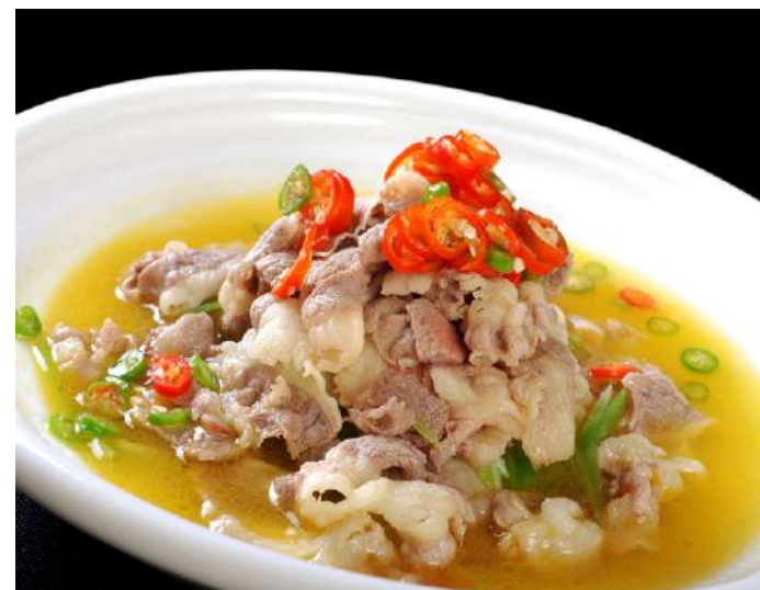
11005 酸汤肥牛 M-$32.00 L-$60.00 Wagyu Beef in Sour Soup