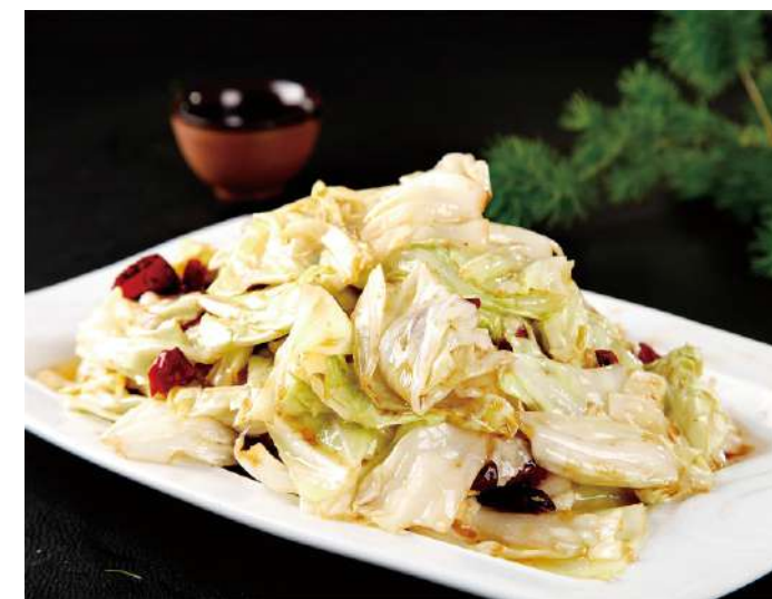
11006 手撕包菜 M-$13.80 L-$23.80 Stir fried Cabbage