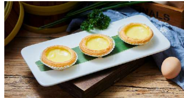
15020 香滑烘蛋挞 $6.80/3 Creamy Smooth Egg Tart