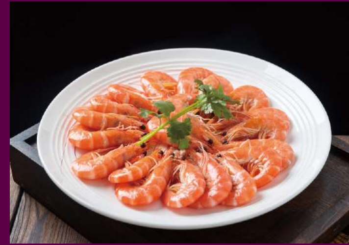
80003 草虾/老虎虾 $8.80/100g Grass Shrimp/Tiger Shrimp