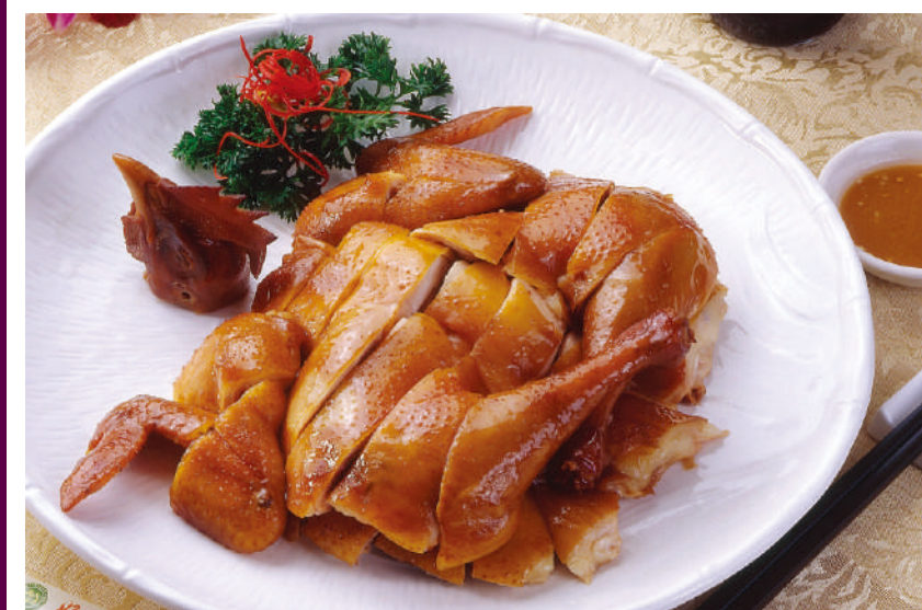
10012 招牌贵妃鸡 $30/半只 $50/只 Chaise Chicken