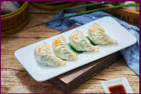
15014 香煎韭菜饺 $7.80/3 SECRET KUNG FU TEA