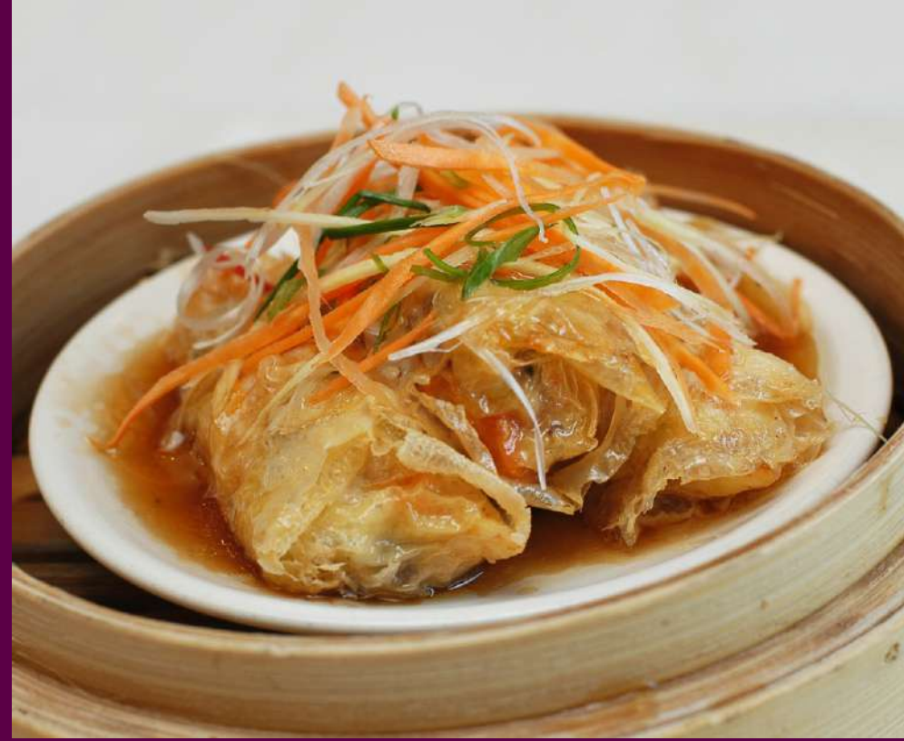
15010 蚝汁鲜竹卷 $6.80/3 Steamed Spring Roll With Oyster Sauce