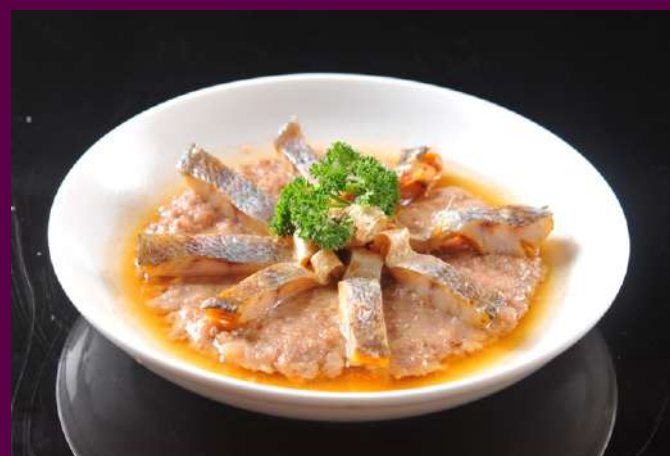
90016 咸鱼蒸肉饼 S-$23.80 M-$32.80 L-$42.80 Teochew Salted Fish Steamed Pork