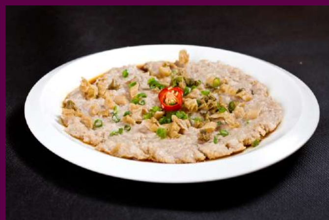
90017 梅菜蒸肉饼 S-$22.80 M-$32.80 L-$42.80 Steamed Pork with Preserved Vegetables