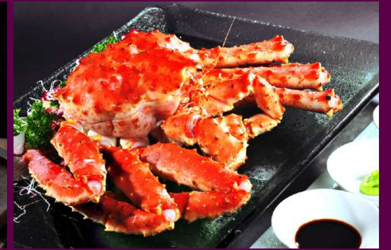
80004 阿拉斯加蟹 $时价 Alaskan Crab