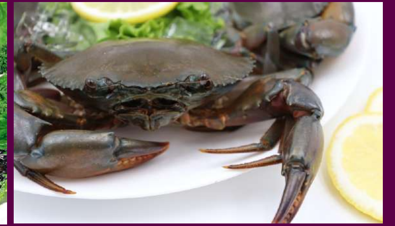
80006 斯里兰卡蟹 $时价 Sri Lankan Crab