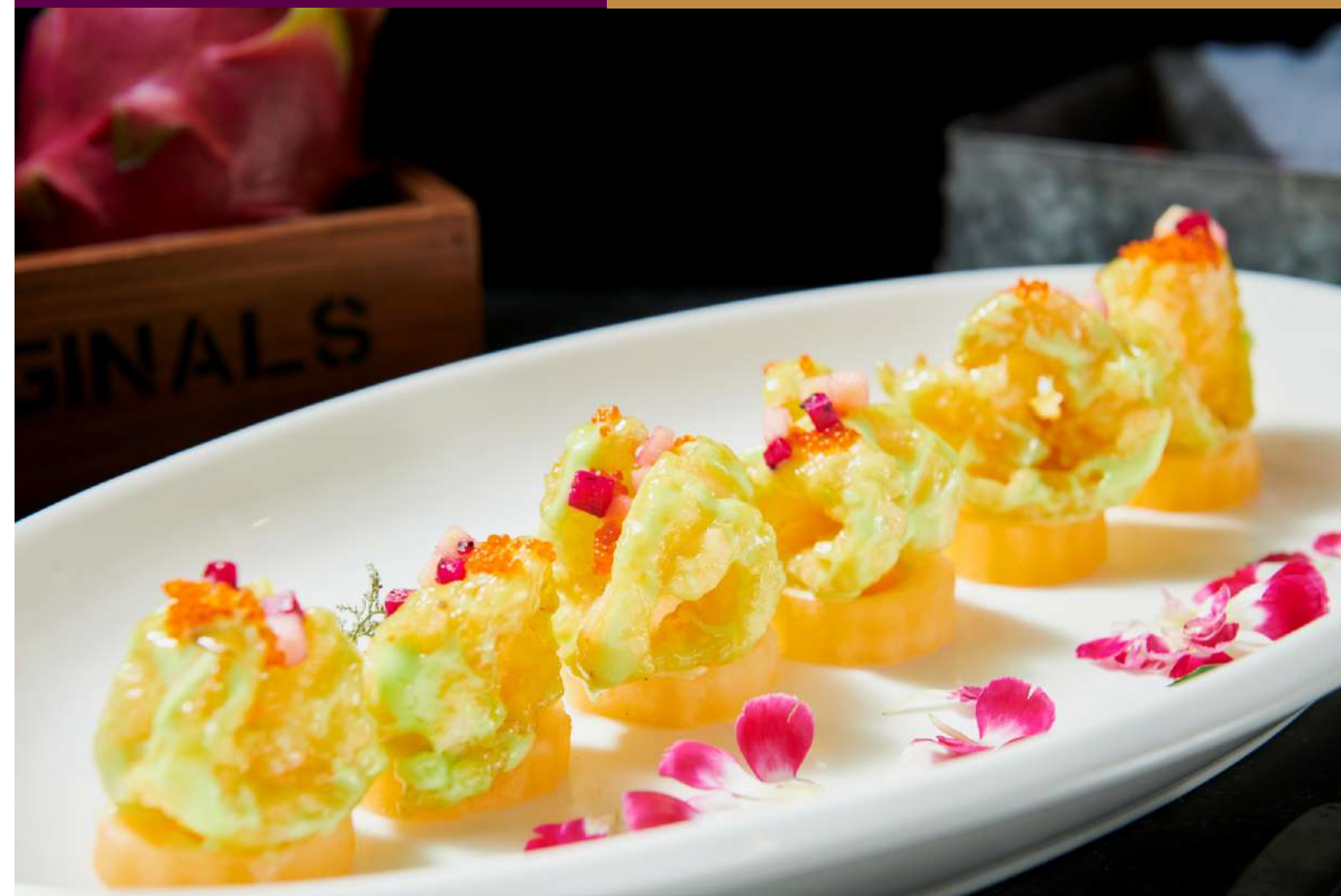
90029 青芥末鲜果虾球 S-$32.00 M-$45.00 L-$60.00 Wasabi Prawn With Fresh Fruit