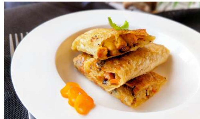
15021 鲜虾腐皮卷 $7.80/3 Shrimp Tofu Skin Roll