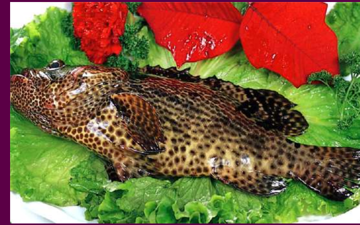
80005 老虎斑 $9.80/100g Tiger grouper