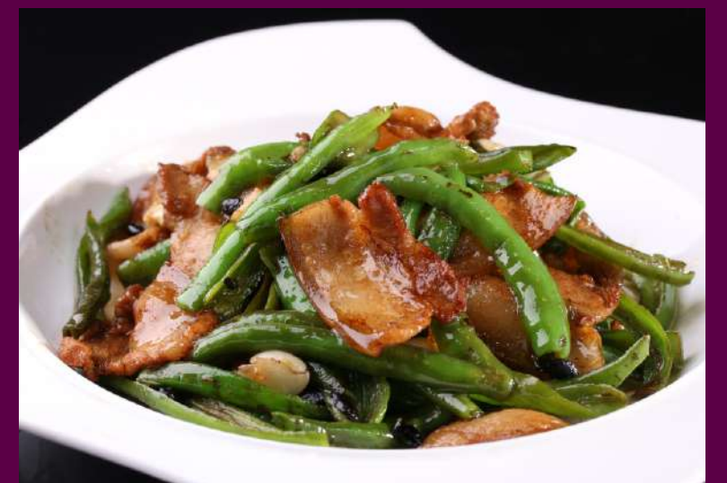
11009 湖南小炒肉 ----- M-$16.80 L-$32.80 Hunan Fried Pork