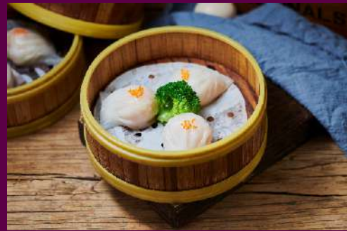
15011 水晶鲜虾饺 $7.80/3 Crystal Shrimp Dumplings