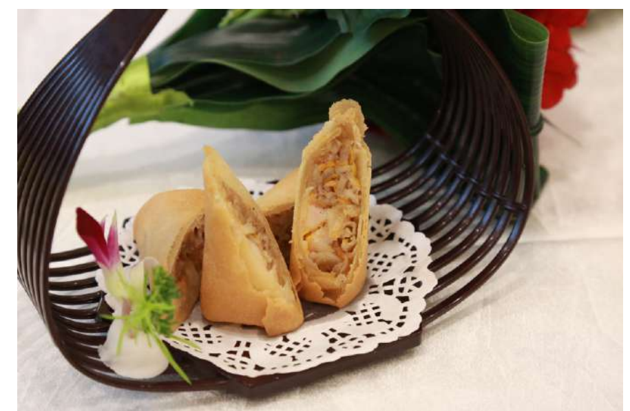
15026 香芒炸虾筒 $6.80/3 Fried Shrimp Roll With Mango