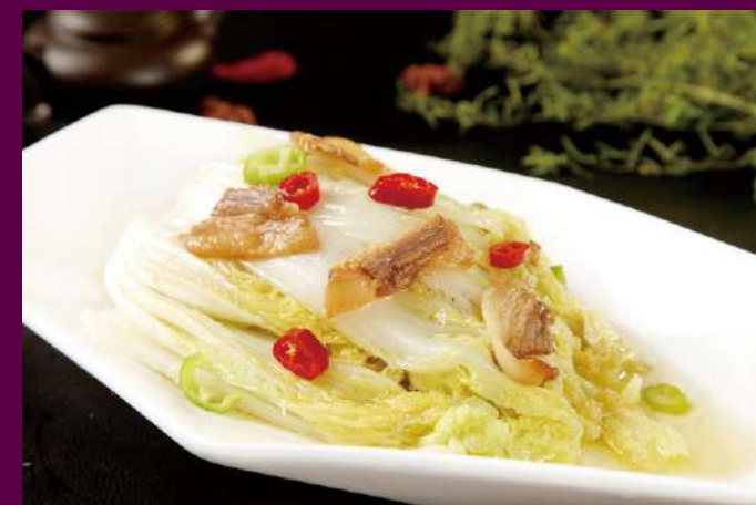
13004 娃娃菜 M-$18.80 L-$28.80 Baby Cabbage