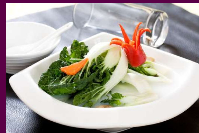
13002 奶白菜 M-$18.80 L-$28.80 Milk Cabbage