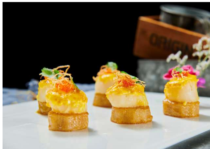
10007 蒜香烤带子茄皇 $36.00 Grilled scallops with garlic