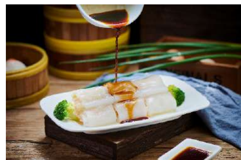
15018 肠粉 (叉烧, 鲜虾, 带子, 腊肠。。。) $4.80/6.80/6.80/7.80/6.80 Steamed Rice Roll Barbecued Pork, Fresh Shrimp, Scallop, Chinese Sausage