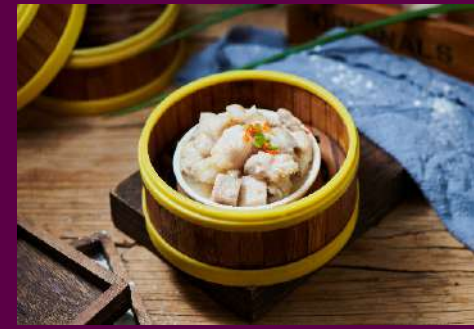
15015 豉汁蒸排骨 $6.80 Steamed Pork Ribs With Black Bean Sauce