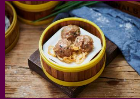
15016 果香蒸牛丸 $6.80/2 Steamed Fruity Beef Balls