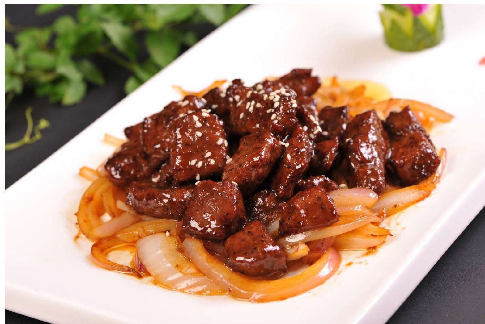
90030 黑椒牛肉粒 S-$32.00 M-$45.00 L-$58.00 Beef With Wild Mushroom