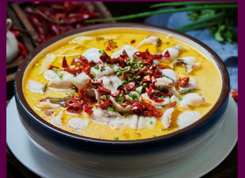
11007 酸菜鱼 M-$32.00 L-$60.00 Pickled vegetables Fish Sliced