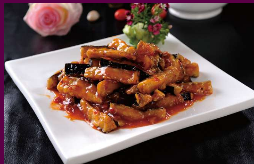
12003 香脆茄子 S-$15.80 M-$25.80 L-$35.80 Crispy Eggplant