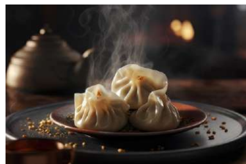
15017 菠菜苗蒸饺 $7.80/3 Steamed Spinach Dumplings