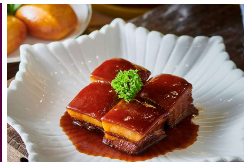
10011 东坡肉 S-$28.00 M-$42.00 Braised Pork Belly