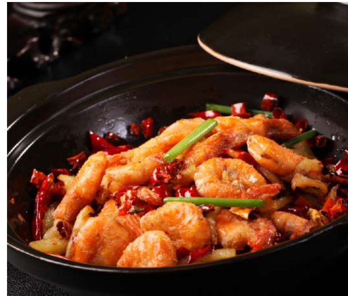
11004 飘香香辣虾 M-$28.00 L-$40.00 Delicious Spicy Shrimp