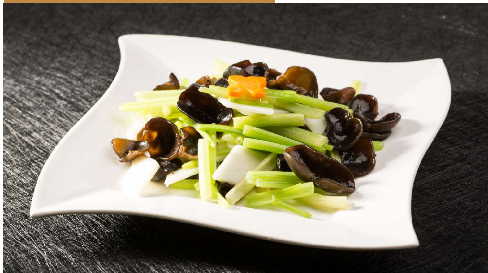
12001 西芹淮山炒木耳 S-$22.00 M-$32.00 L-$42.00 Stir Fried Black Fungus with Celery