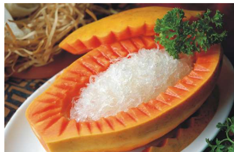
50014 原只木瓜炖官燕 $28.00 Stewed Bird Nest with Papaya