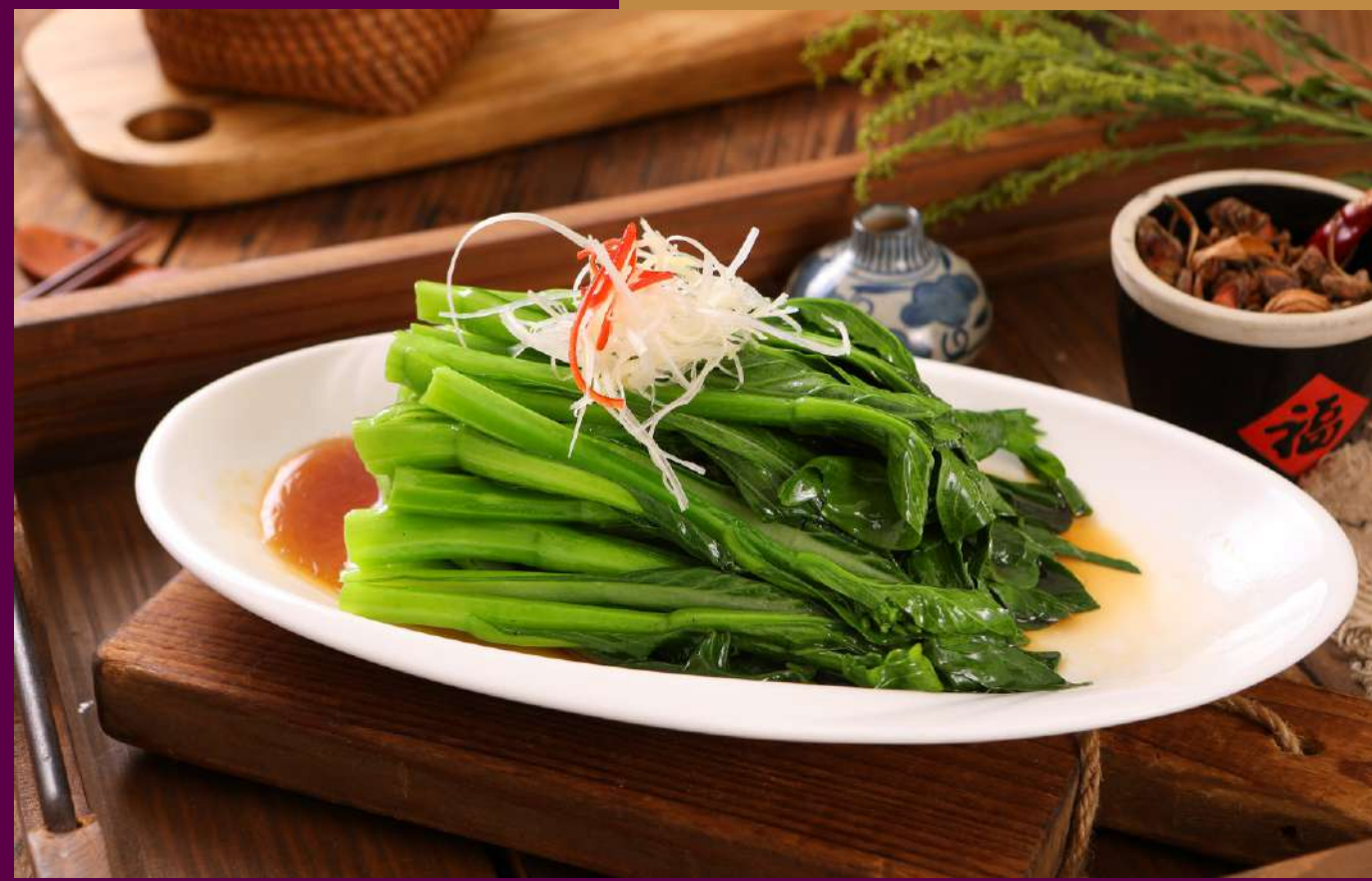
13001 菜心 M-$18.80 L-$28.80 Choy Sum