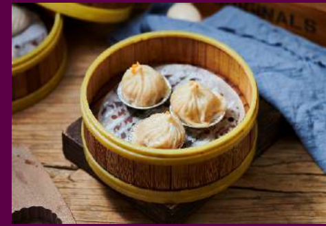
15012 干贝袋子饺 $7.80/3 Dried Scallop Dumplings