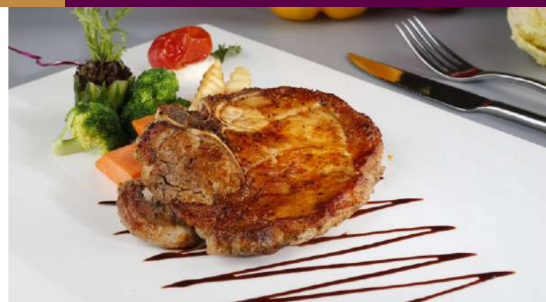
90014 黑松露香煎黑豚猪扒 S-$30.00 M-$42.00 L-$52.00 Pan Fried Black Pork Chop with Black Truffle Sauce