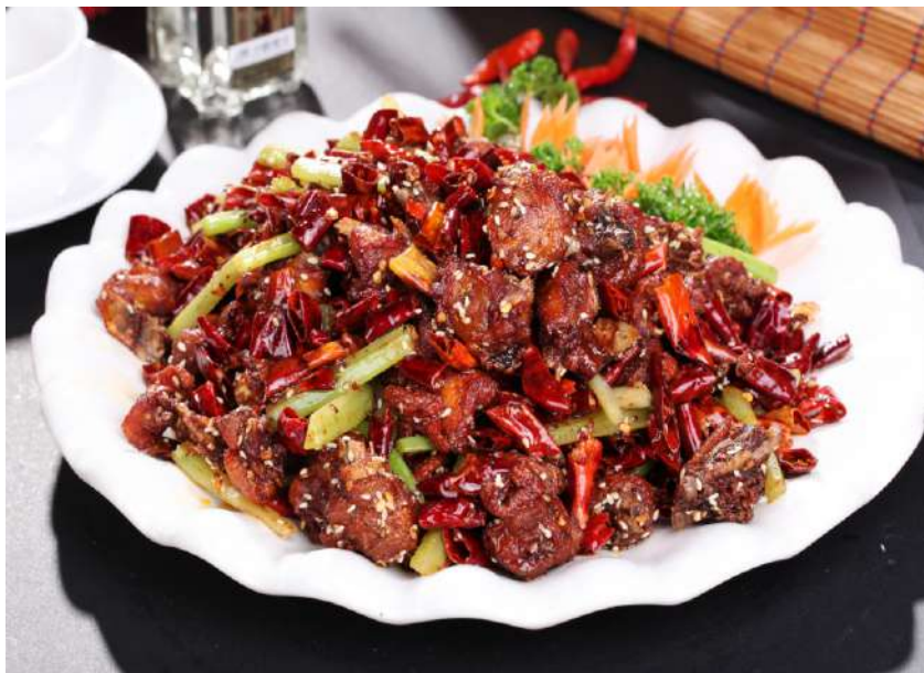
11002 重庆辣子鸡 Chongqing Spicy Chicken M-$28.00 L-$50.00