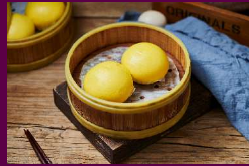
15009 飘香流沙包 $6.80/2 Fragrance Salted Egg Custard Bun