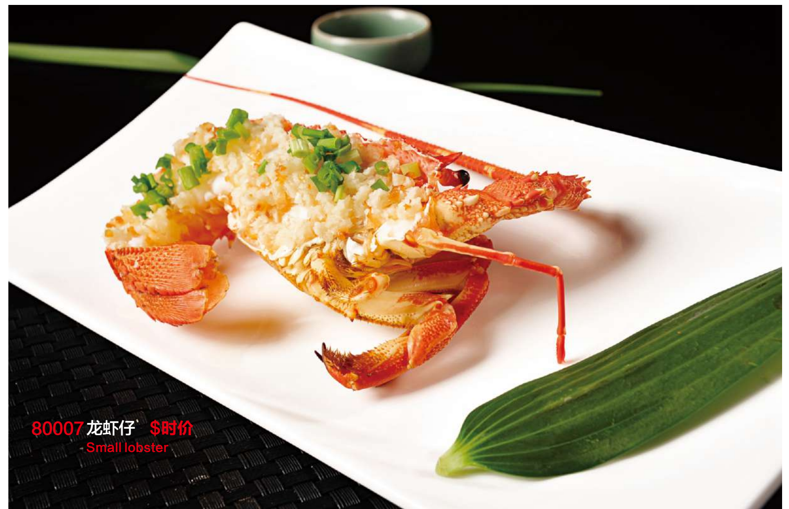
80007 龙虾仔 $时价 Small lobster