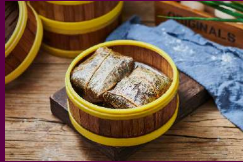
15008 荷叶珍珠鸡 $6.80/2 Steamed Chicken Lotus Leaf rice