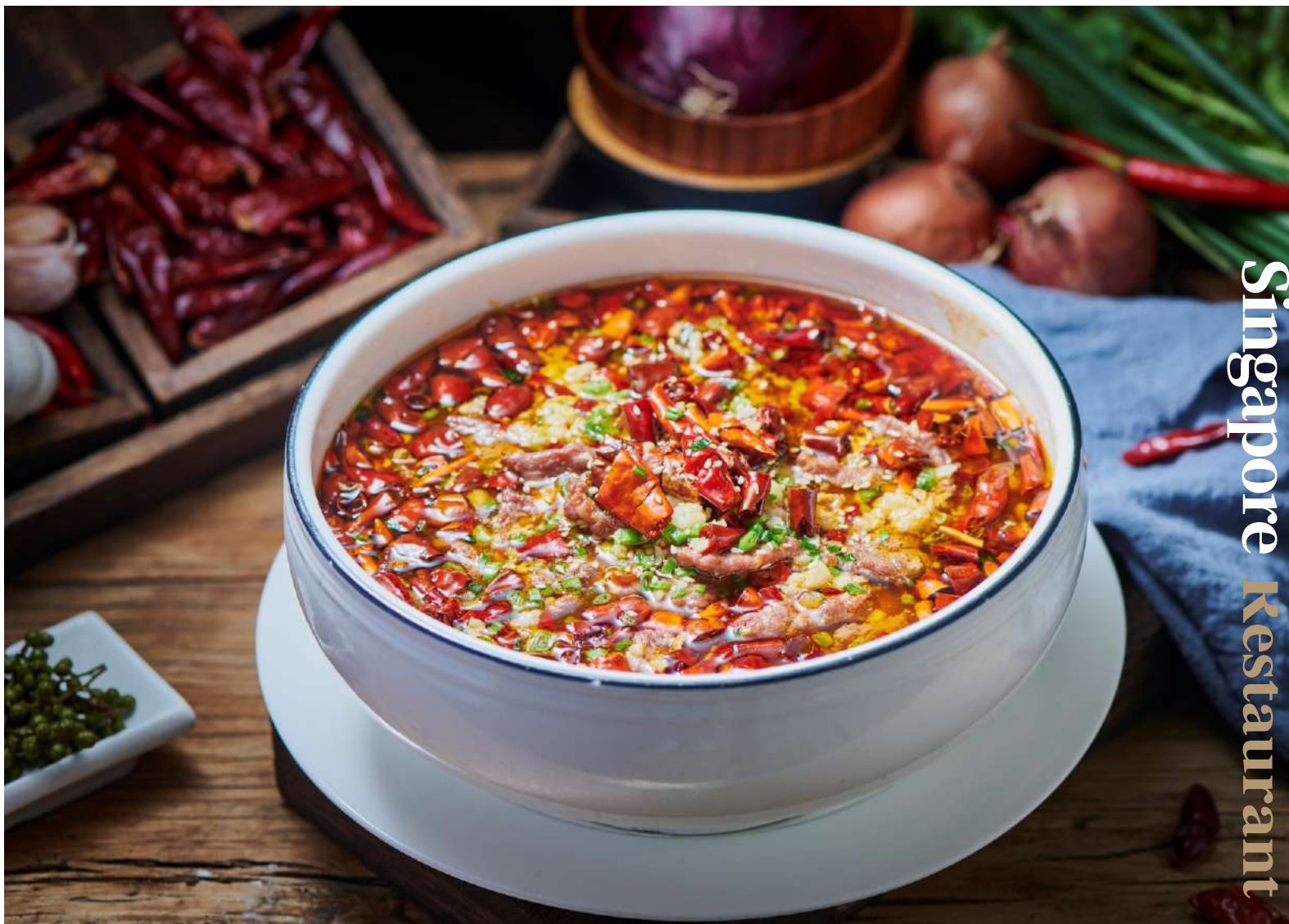
11003 水煮牛肉 M-$32.00 L-$60.00 Sichuan Boiled Beef