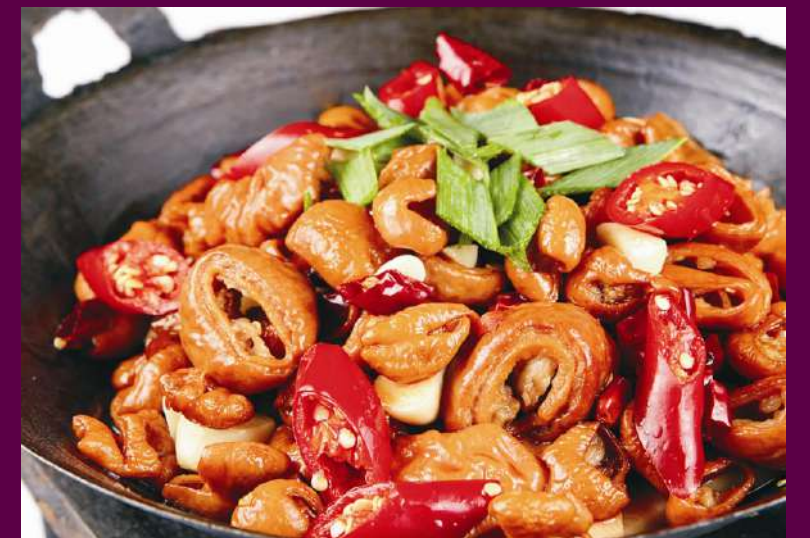
11008 干锅肥肠 ----- M-$28.00 L-$55.00 Craypot Dry Chitterlings