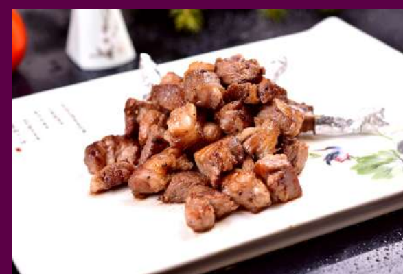
10008 青柠海盐牛肉粒 Beef Cubes with Lime Sea Salt S-$38.00 M-$55.00 L-$72.00