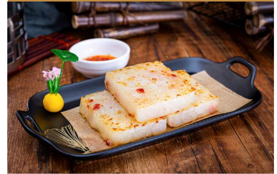
15025 香煎萝卜糕 $6.80/3 Crispy Pan Fried Carrot Cake