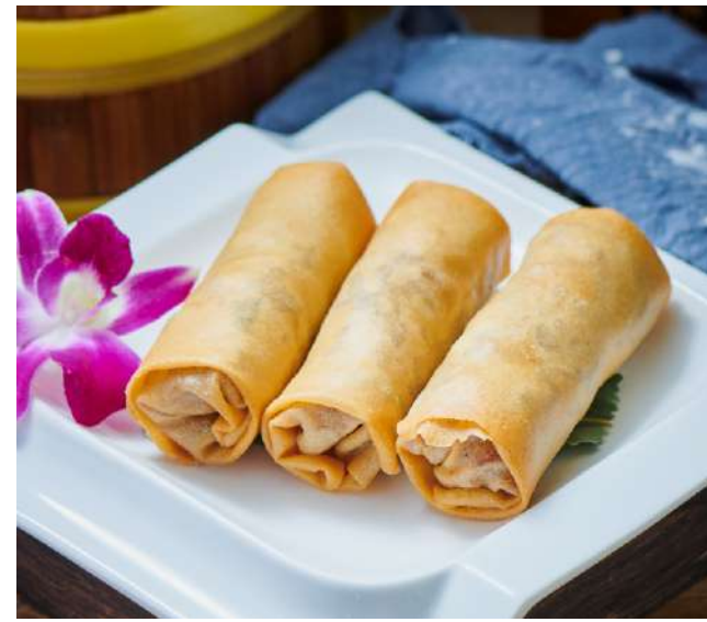
15019 鸭肉炸春卷 $7.80/3 Duck Meat fried Spring Roll