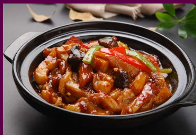
90015 鱼香茄子煲 S-$22.80 M-$32.80 L-$42.80 Claypot Fish Flavoured Eggplant