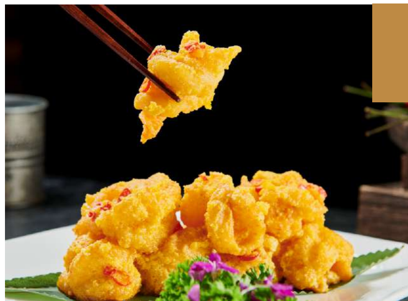
10006 黄金虾球 Golden Shrimp Balls S-$32.00 M-$45.00 L-$60.00