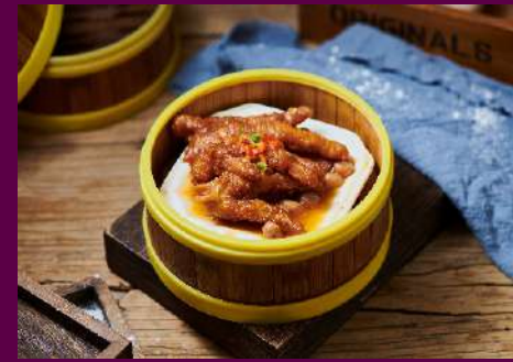
15013 桂林酱蒸凤爪 $6.80 Guilin Steamed Chicken Feet