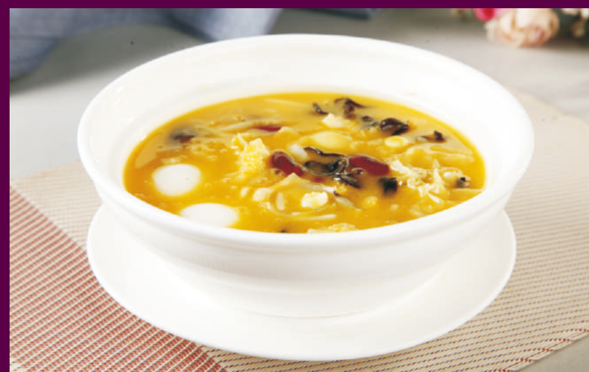
12002 素佛跳墙 $18.80 Vegetarian Buddha Jump Over The Wall